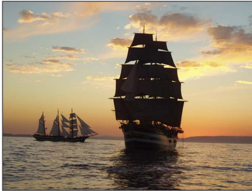
Sunset off Cape d'Antibes

Here are some pictures I like most: almost fifty years separate the first one alongside USS Forrestal and the other two taken last summer.