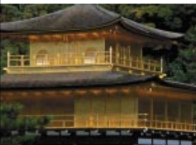
Kinkaku-ji (Golden pavilion)

After breakfast we say goodbye. However we strongly recommend you to attend our optional tour to Kushimoto, a small cape-town at the southern end of the Kii peninsula.