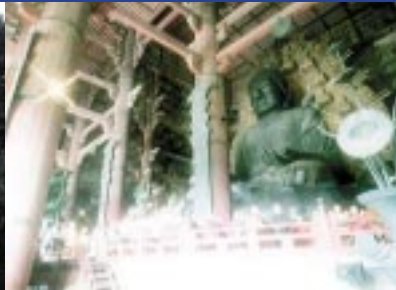
Daibutu (15m Buddha)