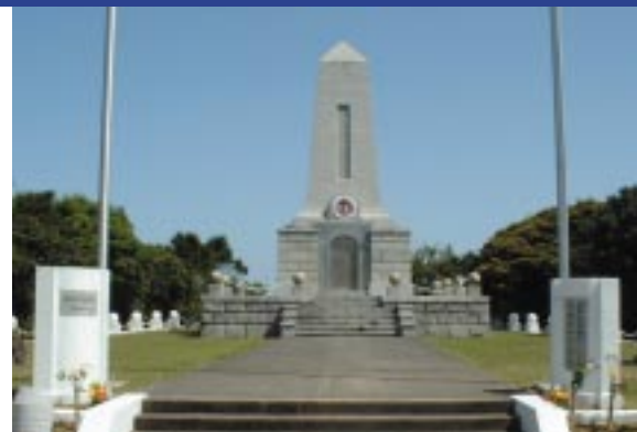
The Turkish Monument

After breakfast we head back home via Osaka.