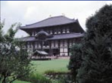
Toudai-ji (Biggest wooden building in the world)