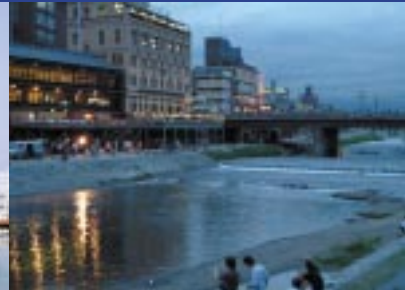
Chimoto: Famous Japanese restaurant in Kyoto