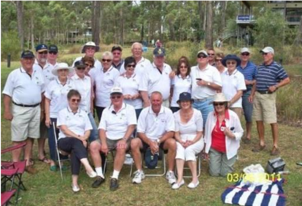
Members of the Hunter Fleet (NSW Australia) 'Class of 2011' Observation Trial.

It may have been a little overcast on the 6 th April but that did not lessen the atmosphere as five vessels of the Hunter Fleet (Australia) with their crew headed down beautiful Lake Macquarie (north of Sydney - New South Wales) in search of the answers to the questions posed on the examination sheets provided to test their navigational and observation skills.