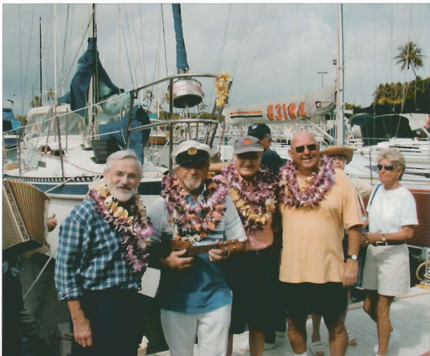
The Hawaii sailors