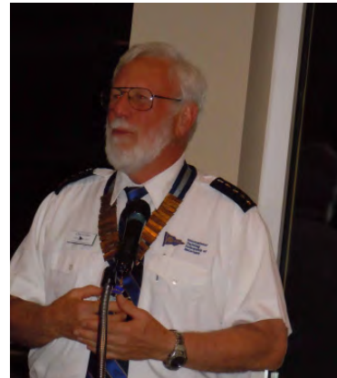
Commodore Clint Collier