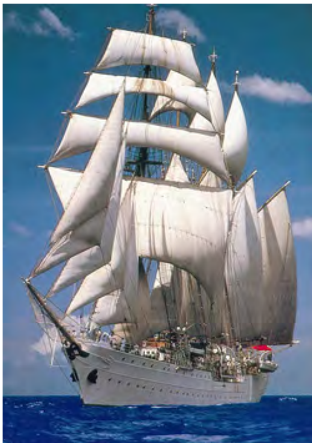
Chilian Esmeralda enters San Francisco Bay

Some of you may be wondering why there is a picture of the Chilean training ship Esmeralda associated with the commodores column. It's a simple enough explanation. This training ship is currently sailing the Pacific area and recently stopped in San Francisco for a four day visit. The San Francisco fleet hosted a number of the cadets off the ship when they visited Sausalito, a local community that is a Sister City to Vina del Mar in Chile. Several of the members of the San Francisco Fleet were invited to attend a Captain's reception onboard this beautiful vessel and it turned out to be a very productive and fun filled event for all of us.