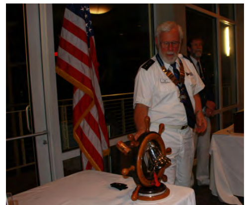
End of the New Orleans IYFR Meeting