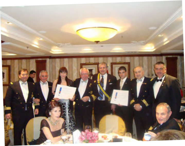
IYFR Madrid Receives Grant IYFR Madrid members received a grant from the IYFR World Committee of 2000€ ($1600).