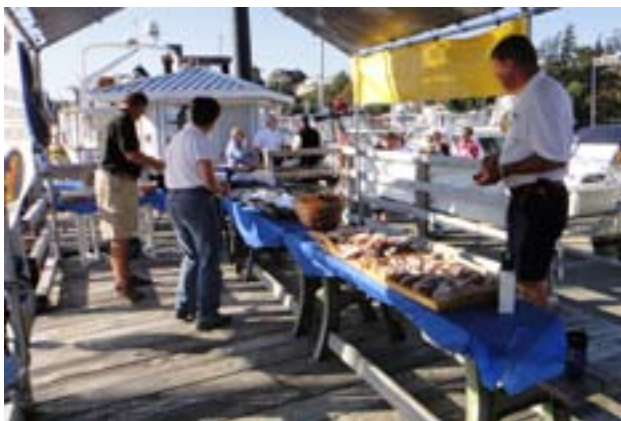
Fellowship and food on the docks at Friday Harbor, San Juan Island Hands Across the Border