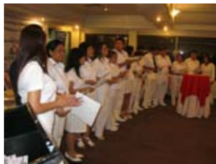
Members of the Silver Star Philippine Fleet.