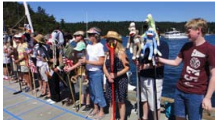
The horse races... the riders line up with their "steeds"

reception, our meet & greet party has been "upgraded" to include a fantastic venue as well as Thai food to complement the evening. Read the article later in the newsletter for more information on our events. I hope a great number of you will be able to join us; I think you will find our activities unique and want to thank