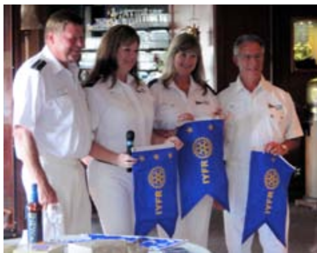
New officers of the San Juan Fleet

Next month I will be at the Zone 25/26 Institute to promote IYFR and the Fellowship program and then Bev and I are preparing to head off to Switzerland for the Area 1 conference being held in Geneva under the sponsorship of our Swiss fleet.